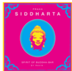
Clockwise: The wise one himself smiling down Dim lights add to the atmosphere Asian inspired cocktails are served at the bar

It has big brothers in capitals such as Paris, London, Dubai, Beirut, Cairo, Kiev, Sao Paolo, and Jakarta and twins in cities the likes of, Las Vegas and Sharm el Sheikh. On March 24th Amsterdam gave birth to its very own Little Buddha Sushi Bar & Lounge, providing the canal city with a new 'eatertainment' option perfectly blending Pacific Rim cuisine with live DJ grooves and top quality service.